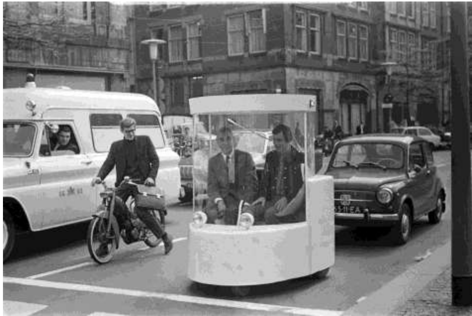
Witkar, Amsterdam 1968